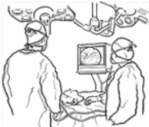
Endoscopic plastic surgery in progress

Sagging eyebrows can be lifted to a higher level. The procedure on its own can be carried out as a day case or with one night in hospital under general anaesthesia or local anaesthesia with intravenous sedation. There is usually swelling around the eyes after surgery which takes a few weeks to settle. Hair is sometimes lost around the scalp incisions and if this is the case it takes several months to re-grow.